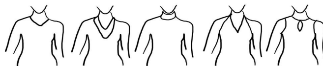
Can Work for a Headshot